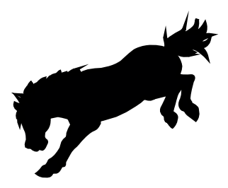
Fighting between horses could break out and cause an injury