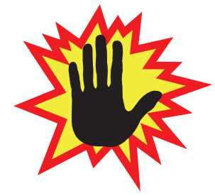
Horses may mistake your fingers for food and accidentally nip them