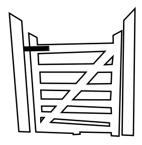
Leave gates and property as you find them